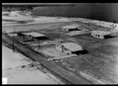
First 4 Homes May 1958