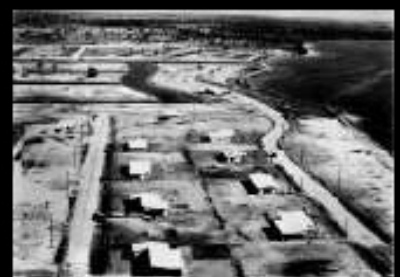
First 8 Homes September 26 1958