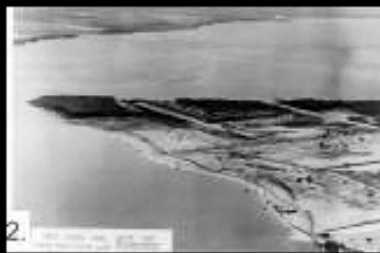
Yacht Basin Area April 1958