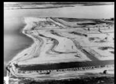
Causeway 1958 First 4 Homes