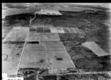
March 25 1959 Expansion Westward