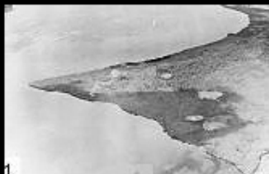
Raw Land 1957